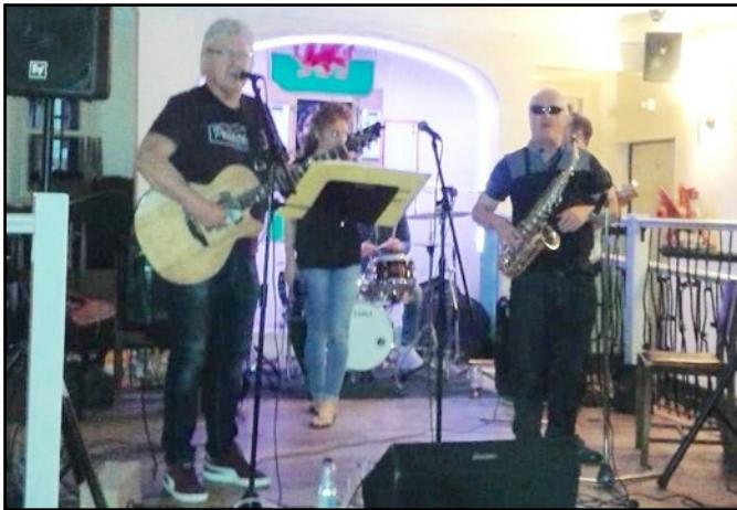
Our old favourites 'Y Moniars' came to entertain us once again and were wonderful as usual.