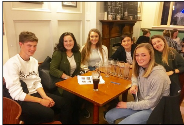
It was great to see a team of Welsh youngsters from Ysgol Morgan Llwyd Sixth form competing in the quiz in Saith. They are determined to beat their teachers next time!