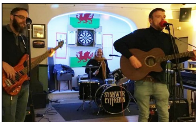
The band from Porthmadog, 'Synnwyr Cyffredin' came and gave an excellent performance.