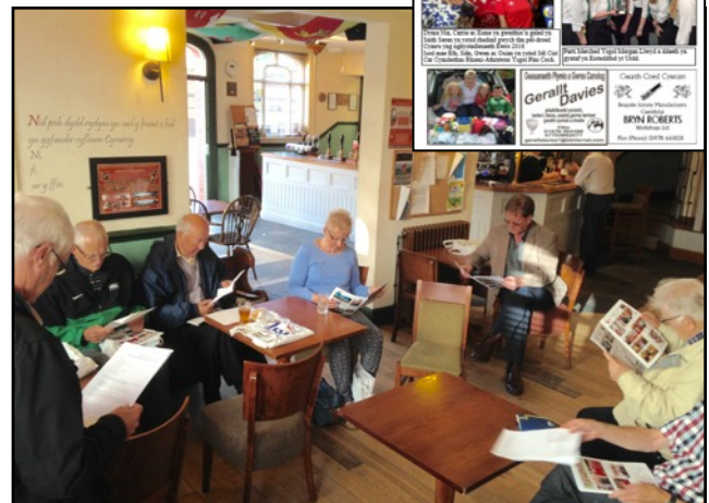
The 'Y Clawdd' Annual General Meeting was held and here everyone studying the latest issue.