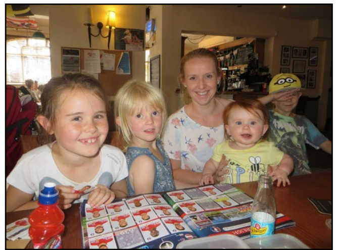
After the excitement of Euro 2016, Menter Maelor organised a football sticker swapping session .