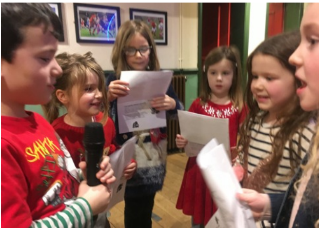
Here are some of the children singing Christmas carols in Saith Seren