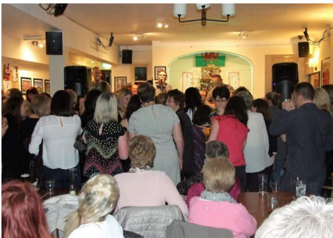
We had an unforgettable night in the company of Bryn Fôn a'r Band. Saith Seren was packed and everyone thoroughly enjoyed the evening.