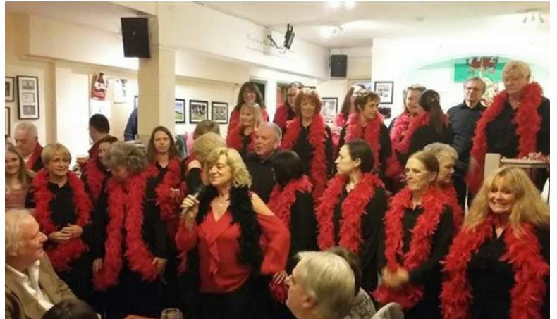
Côr DAW performed at the Wrexham Leanners Christmas party, and Saith Seren was full to capacity!