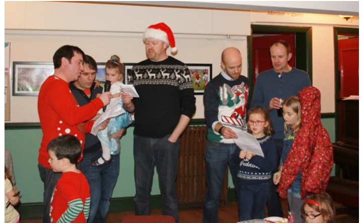
There was a successful party for families on Christmas Eve to sing carols.